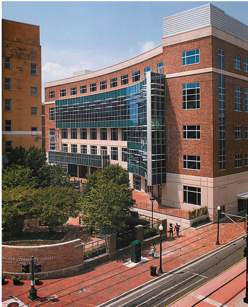
Tidewater Community College Student Center, Norfolk, VA