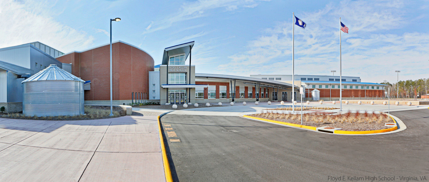
Floyd E. Kellam High School - Virginia, VA