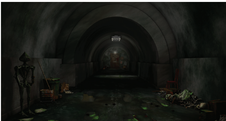
Set in present day New York, Discordia takes a Tet Corporation operative on an investigation to Mid World.