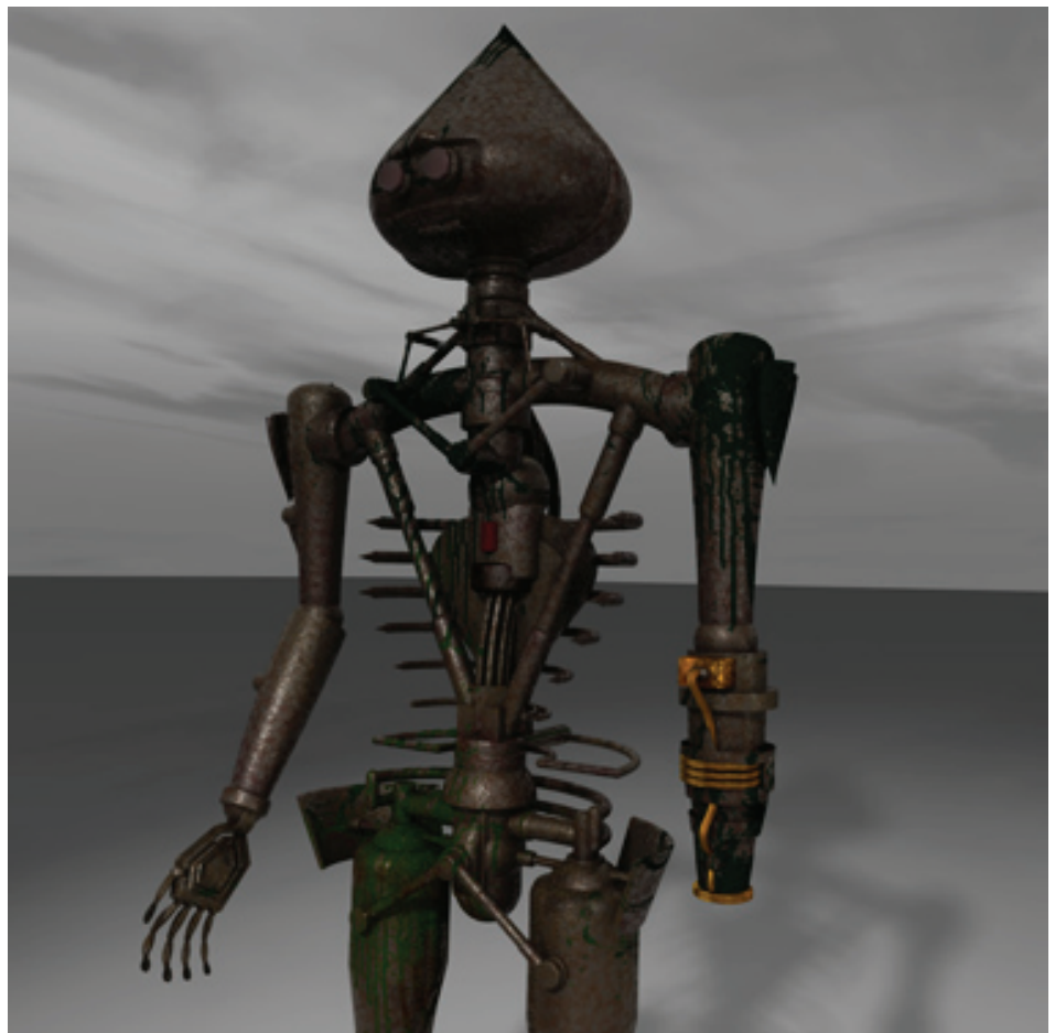
The retro-tech themes inherent to the fictional NCP corporation served as the basis for the site's design.