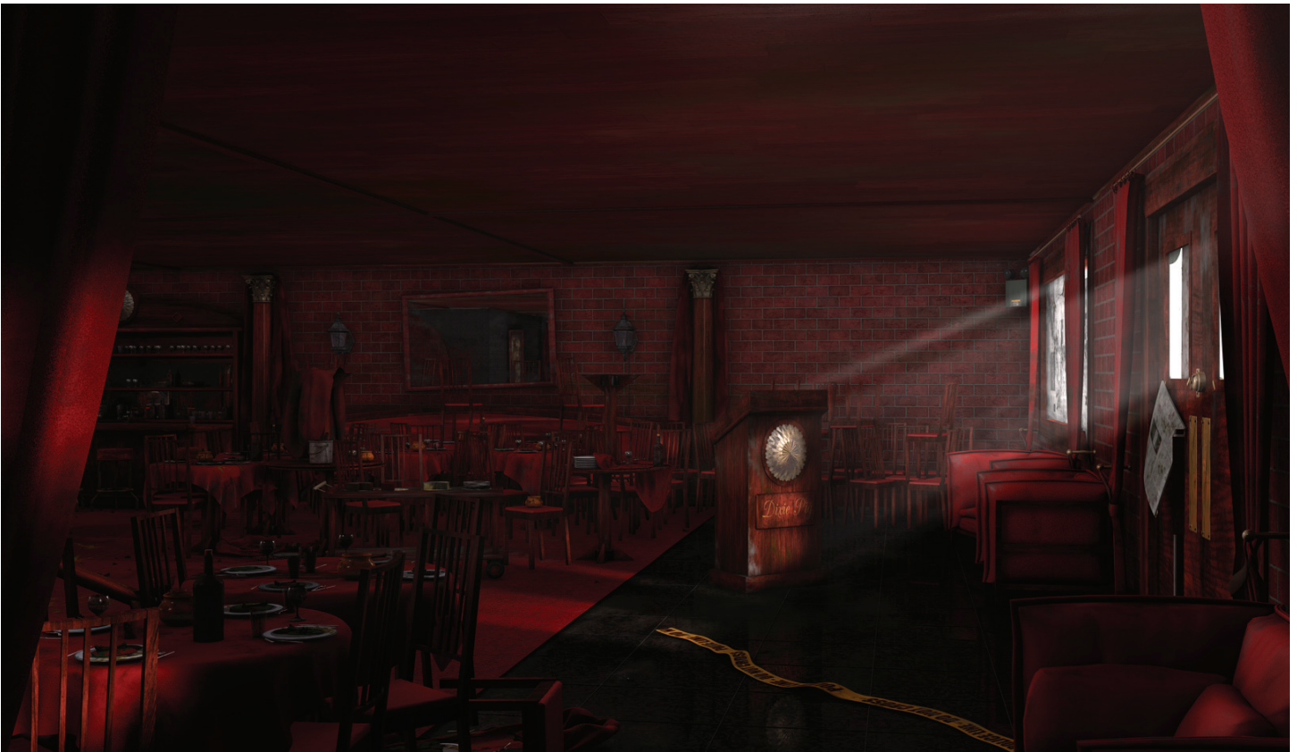
Reaching into their minds: With over 13,000 objects and a staggering 9,000,000 polygons, the Dixie Pig appeared exactly as many fans had imagined.

changed everything for us. It has a CineBench mark of over 30,000! Coupled with Cinema 4D's amazingly fast, high-quality render, we're seeing things now that we would have thought were many years off."