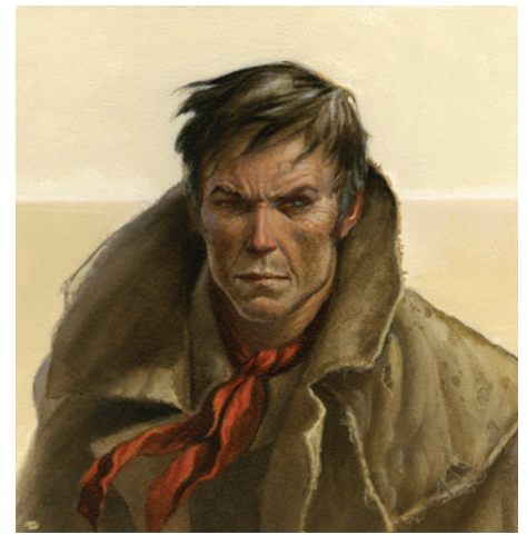
Gunslinger Roland Deschain as envisioned by artist

range of hardware configurations and, as Petit puts it, “what life would be like under each choice.” Stark considered the options and then selected a 3DBOXX 8500, the top of the BOXX workstation line, featuring dual quad-core Intel® Xeon® processors . He also opted for a custom configuration he believed would best suit the workflow demands of both Discordia and stephenking.com. Stark’s confidence in BOXX was buoyed by the fact that all possible BOXX configurations have been pre-tested by BOXXlabs before they are ever chosen by customers. “Everyone at BOXX dealt with us on a level that I would describe as “boutique,” says Stark. “This is a good thing when you’re talking about fine computers.”